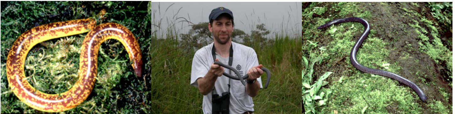
E. bicolor by Luis A. Coloma

Ecuador's caecilians are a little known group of amphibians. Legless and secretive, the caecilians are difficult to study. RLG region is home to Epicrionops bicolor (the two colored caecilian), the endemic Epicrionops marmoratus (marbled caecilian) species, and another unnamed Caecilia sp. (pictured below). These species are sub terrestrial or found very near stream systems and are rarely ever seen. During the hard rains that saturate the soil of RLG, they have been known to surface and attempt to travel to a "drier" location much like all of the other creatures. Their diet consists of earthworms and sub terrestrial arthropods. Since these are so elusive in nature, most caecilian populations have been deemed "data deficient", but possible threats to these species include habitat loss and contamination of their habitats.